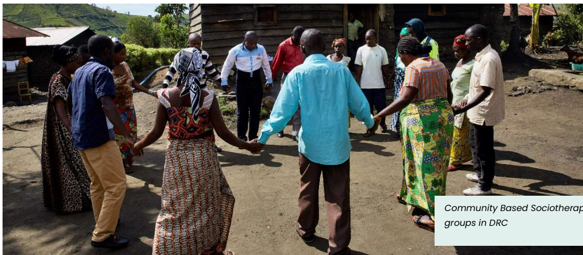
Community Based Sociotherapy groups in DRC

The interventions in both DR Congo and Burundi improved the mental well-being of participants. Participants in DR Congo report that they are less troubled by mental problems and have more self-confidence. 8 They graded their everyday life much higher than before joining a CBS group and indicated an increase in their hope for the future. 9 A beneficiary in Burundi mentioned: 'Over time, counselling sessions, dialogues, supervision sessions provided by THARS have made me a strong man. Today, I am able to see in myself the capacity for resilience to deal with traumatic events' These positive changes are a crucial precondition for people to be involved in any peacebuilding activity, at the community level or beyond, which requires them to be open for dialogue and to work for a more peaceful future.