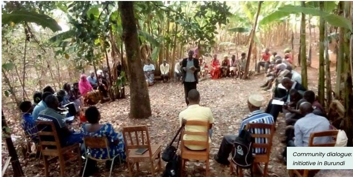
Community dialogue: Memory initiative in Burundi

Intergenerational dialogues 4 led to the set-up of community initiatives and platforms to deal with the past, as well as a book of community stories based on painful past experiences. It is currently used as an educational tool at the community level. These different interventions pull individuals out of their psychological isolation, as they understand that other social groups suffered similar, or worse, fates; which is a first step towards rebuilding relationships between formerly opposed groups. 5