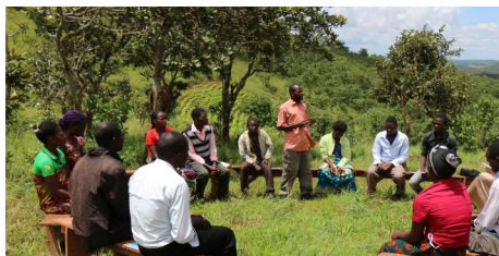
Youth & Work